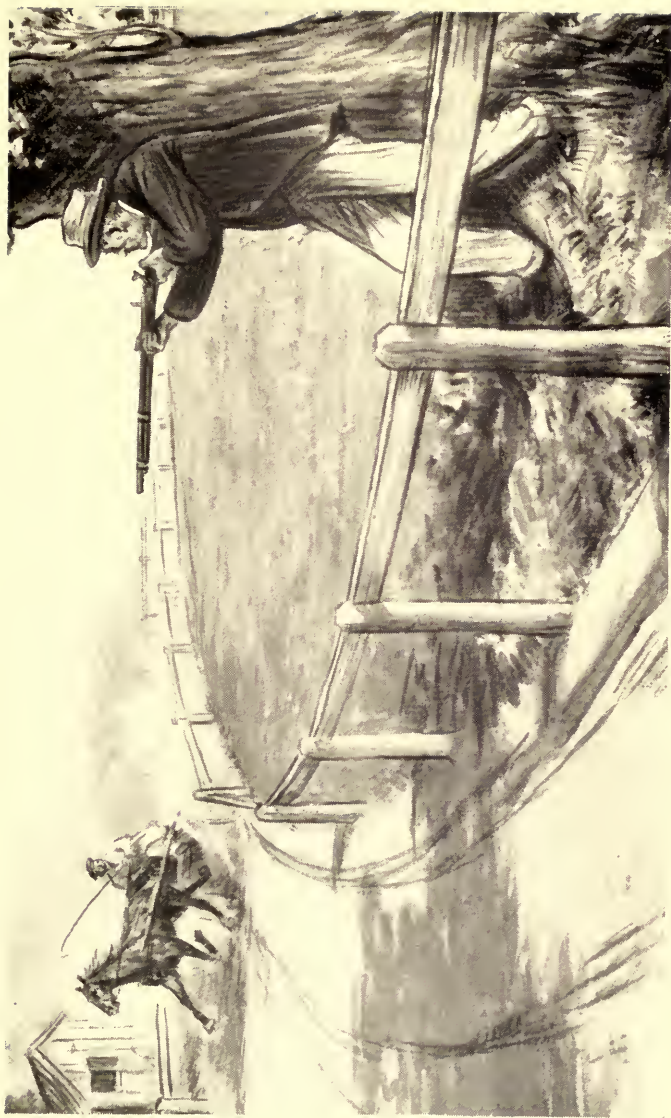
"ALL JACKSON BERRY KNEW WAS THAT THE MUZZLE OF AN AWFUL WEAPON WAS FOLLOWING HIM."